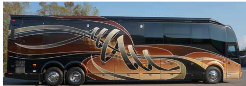
2017 Millennium H3-45 #3008