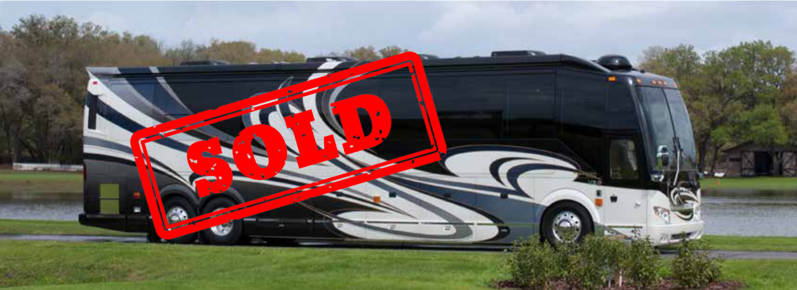
2013 Millennium H3-45 #651