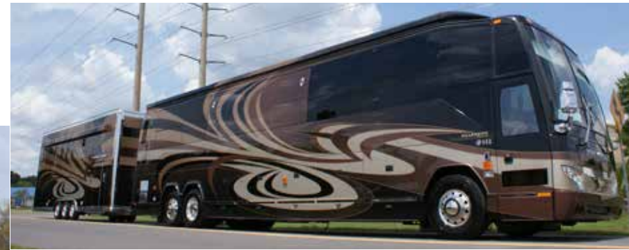
2012 Millennium H3-45 #1663