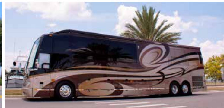
2013 Millennium H3-45 #661