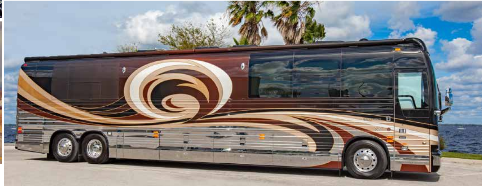
2017 Millennium X3-45 #10123