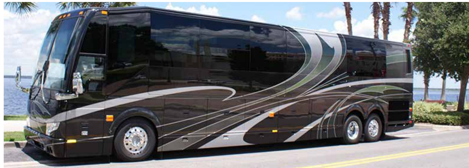
2016 Millennium H3-45 #2694