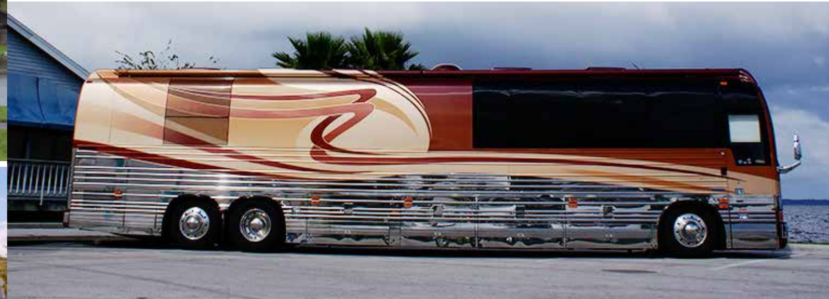
2005 Millennium XL 2 #8152