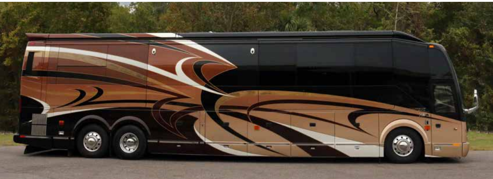
2013 Millennium H3-45 #657