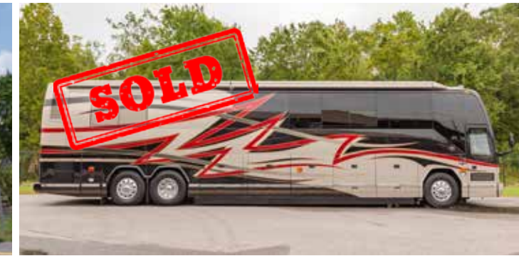
2006 Featherlite H3-45 #4883