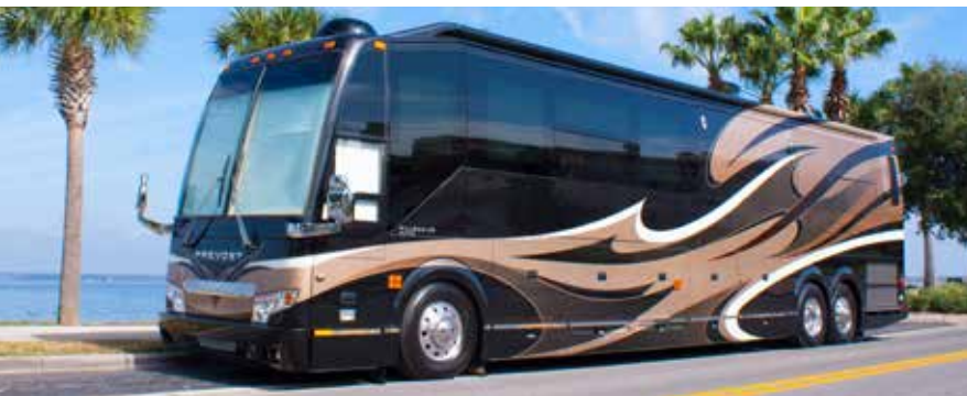
2013 Millennium H3-45 #665