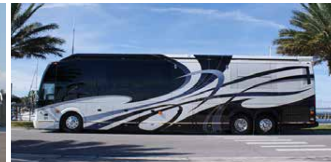
2016 Millennium H3-45 #2660