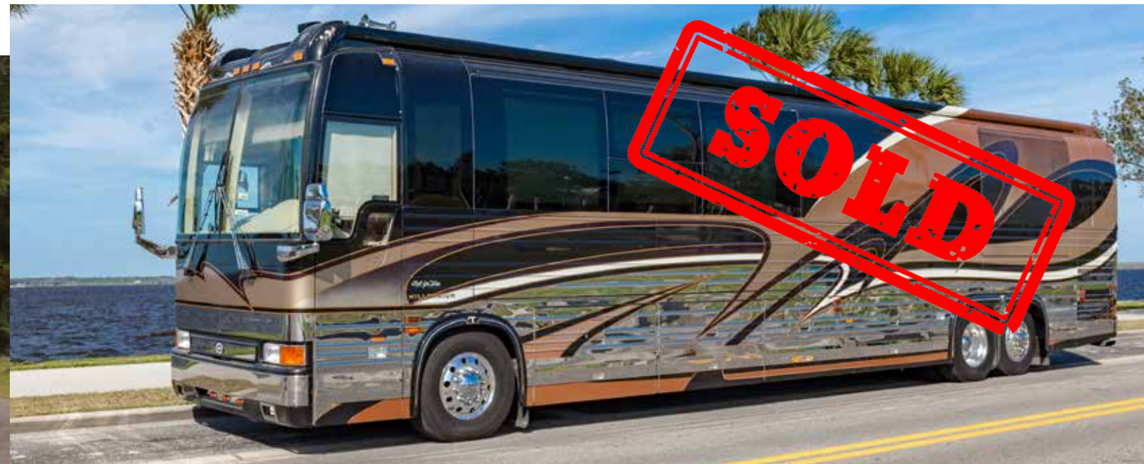
2002 Millennium XL 2 #7482