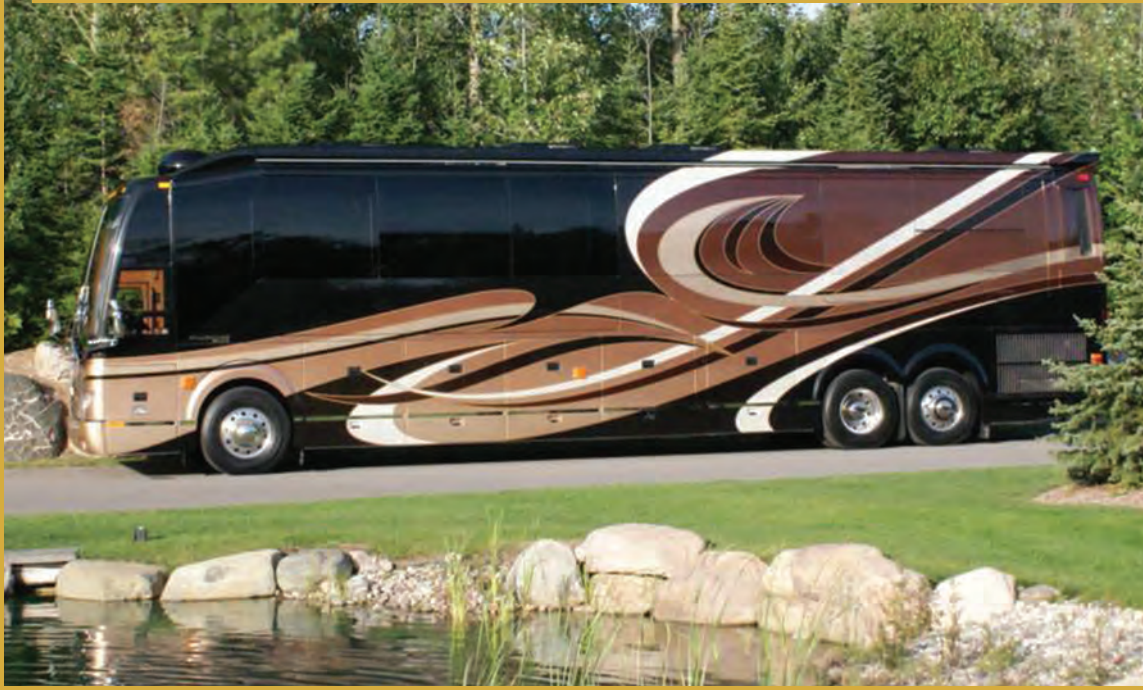
2012 Millennium H3-45 Triple Slide #0599