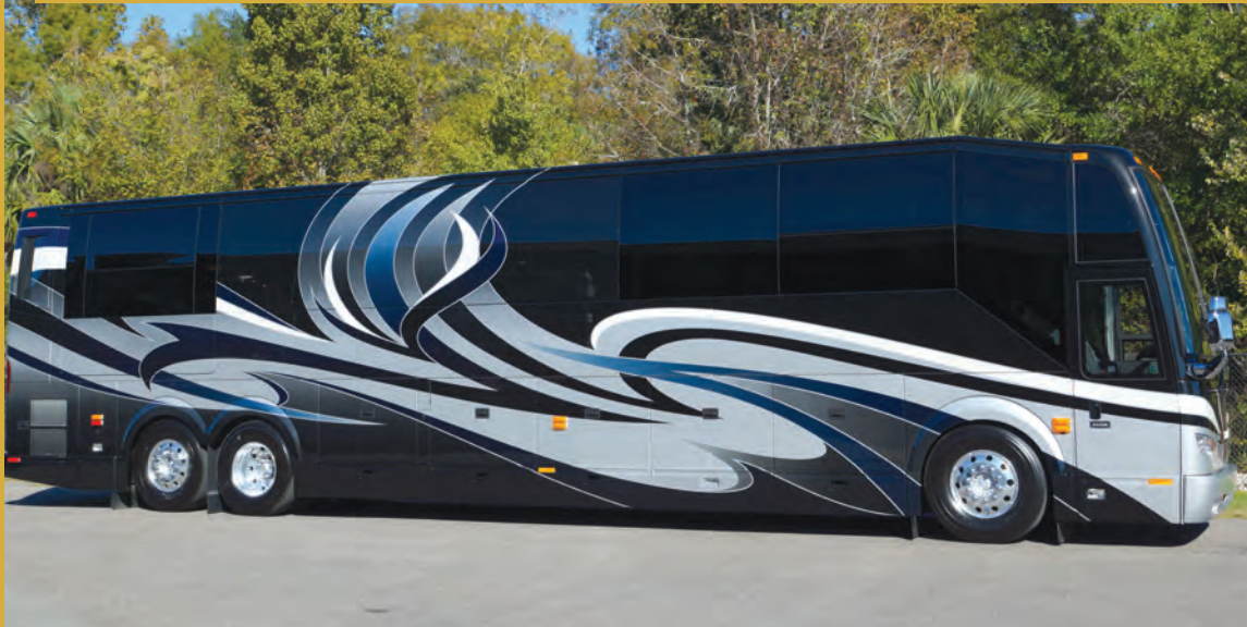
2017 Millennium H3-45 S3 Available April 2016