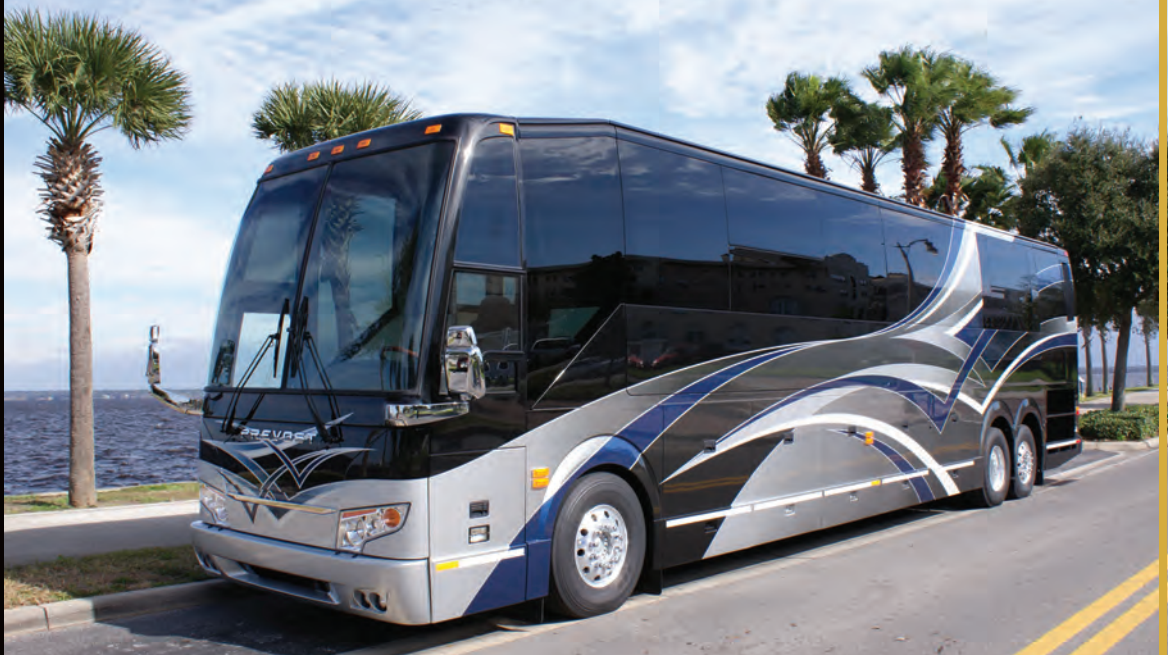
2015 Millennium S4 #617