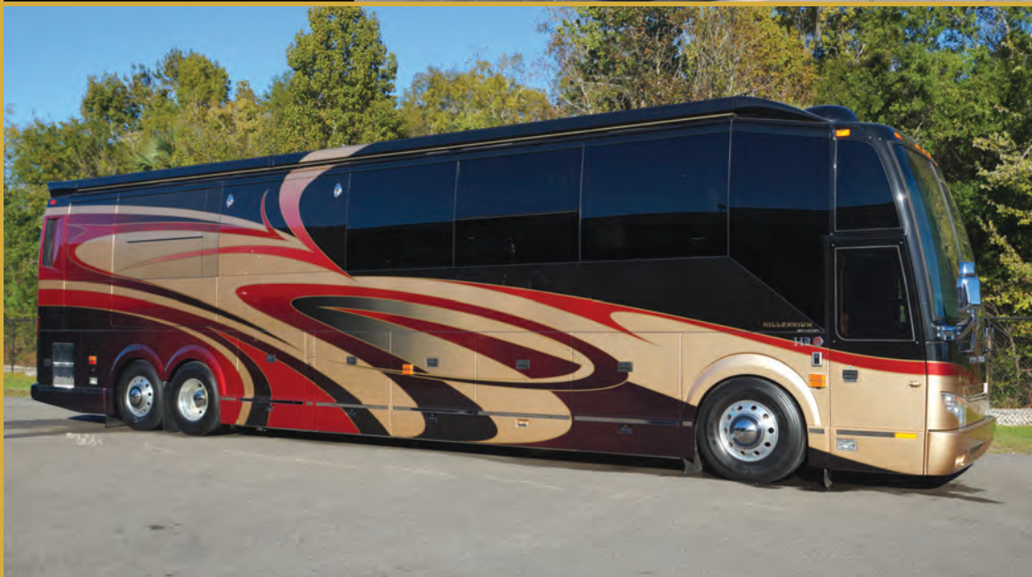
2013 Millennium H3-45 Triple Slide #625