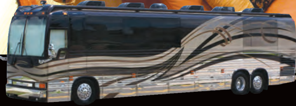
2004 Millennium XLII-S2 #535