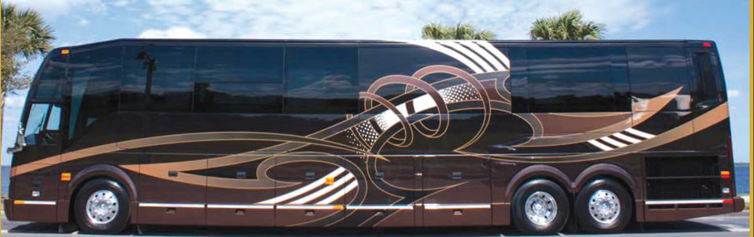
2014 Millennium H3-45 Triple Slide #10086