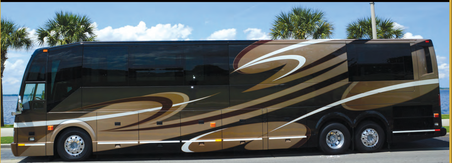
2014 Millennium H3-45 Quad Slide #10088