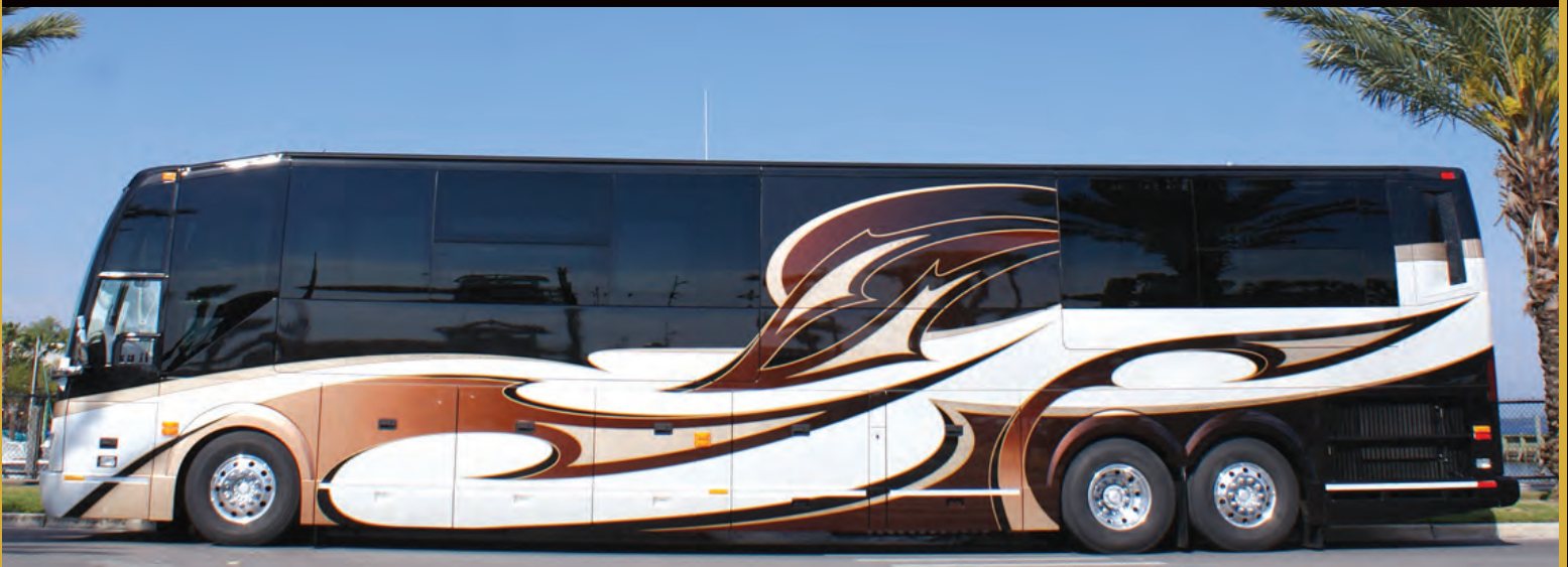
2014 Millennium H3-45 Quad Super Slide #10087