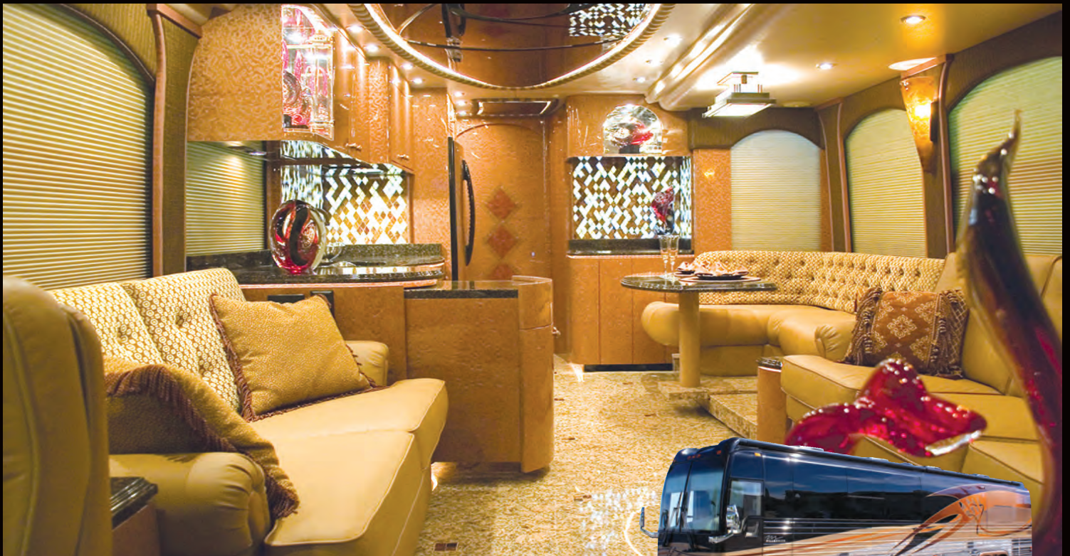
2008 Millennium XLII-S2 #527