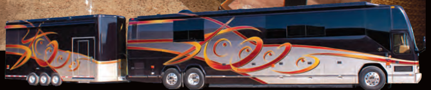
2006 Featherlite H3-45 S2 #517