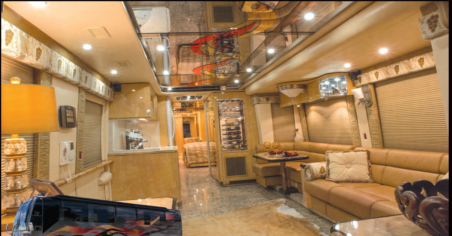
2006 Featherlite H3-45 S2 #538