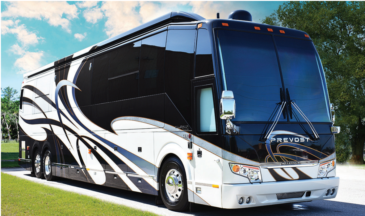
2016 Millennium H3-45 #707