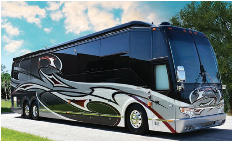
2016 Millennium H3-45 #712