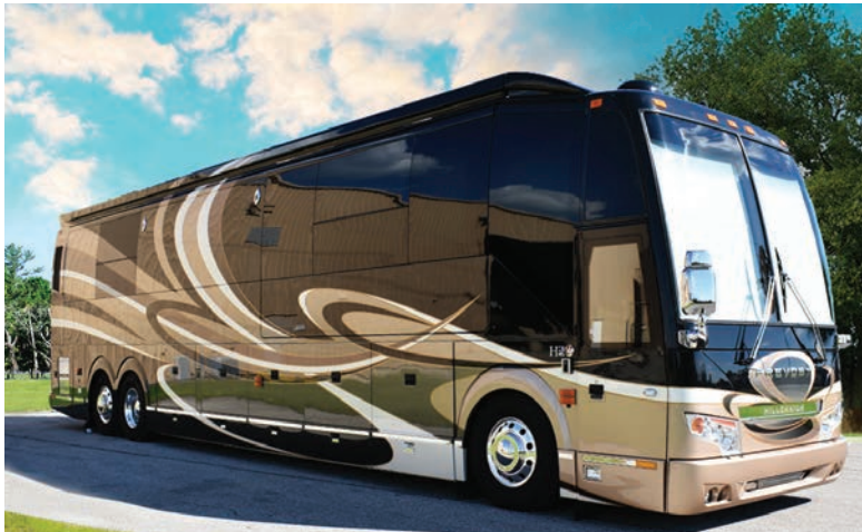
2013 Millennium H3-45 #714