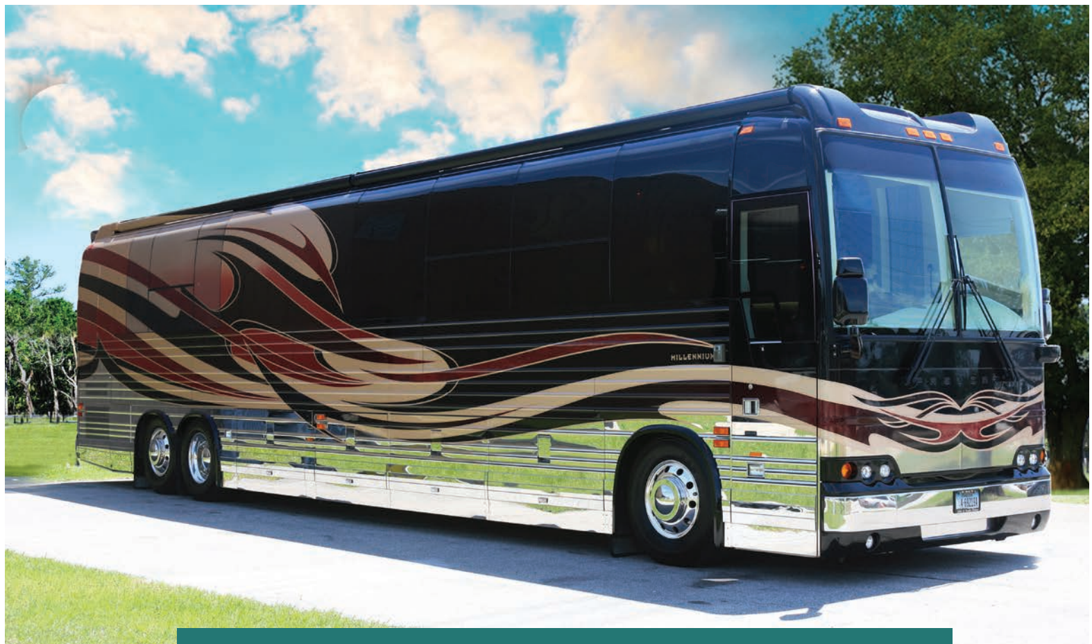
2010 Millennium XLII #702