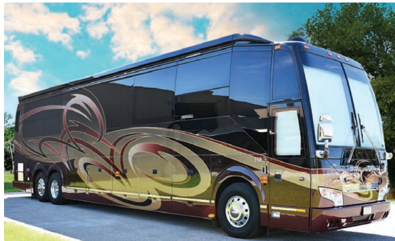
2013 Millennium H3-45 #720