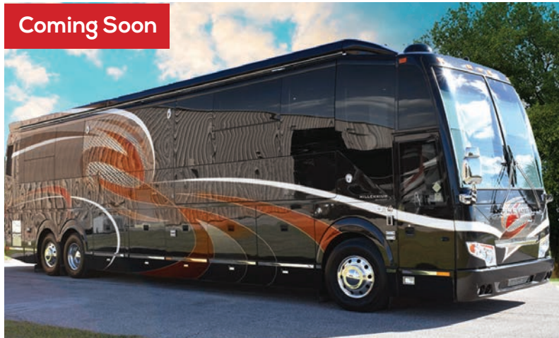
2016 Millennium H3-45 #710