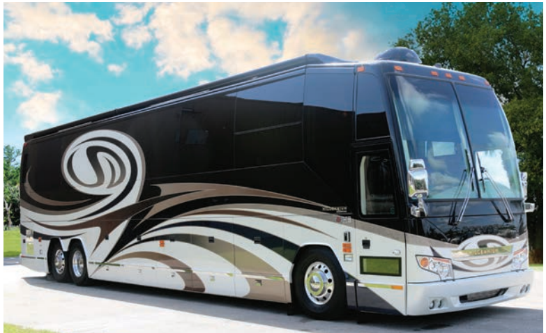
2012 Millennium H3-45 #688