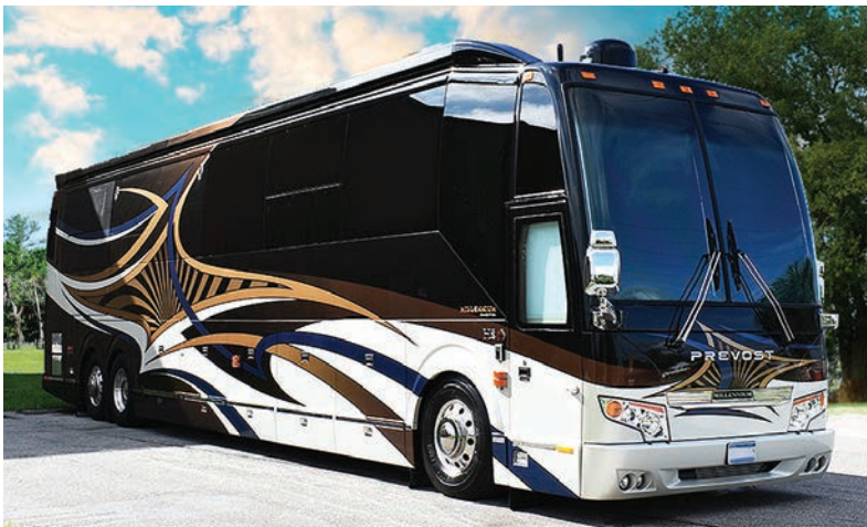
2014 Millennium H3-45 #711