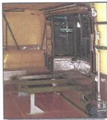
Illustrated with integrated slide-in/slide-out queen bed frame.

The Prevost XLII Slide-Out not only adds more space, it's got a pretty face too, with stainless-steel skin on lower section and flush-mounted wrap-around privacy glass windows above. The Prevost XLII Slide-Out is imperceptible when retracted and becomes a natural extension of the shell when extended. The visual absence of pistons and other mechanical parts makes you wonder how it works!