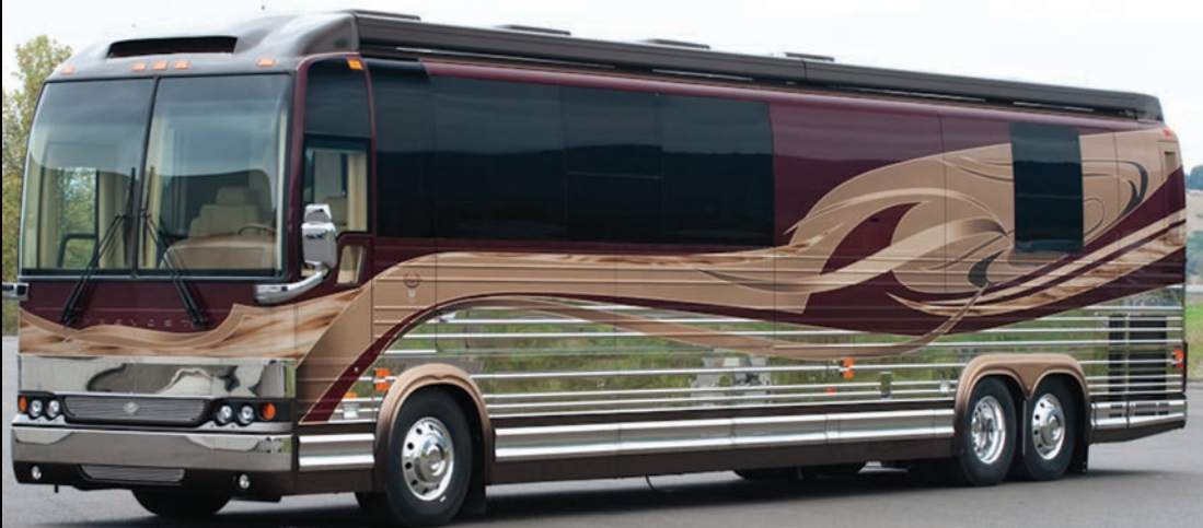
2010 Marathon XLII Triple Slide #0580