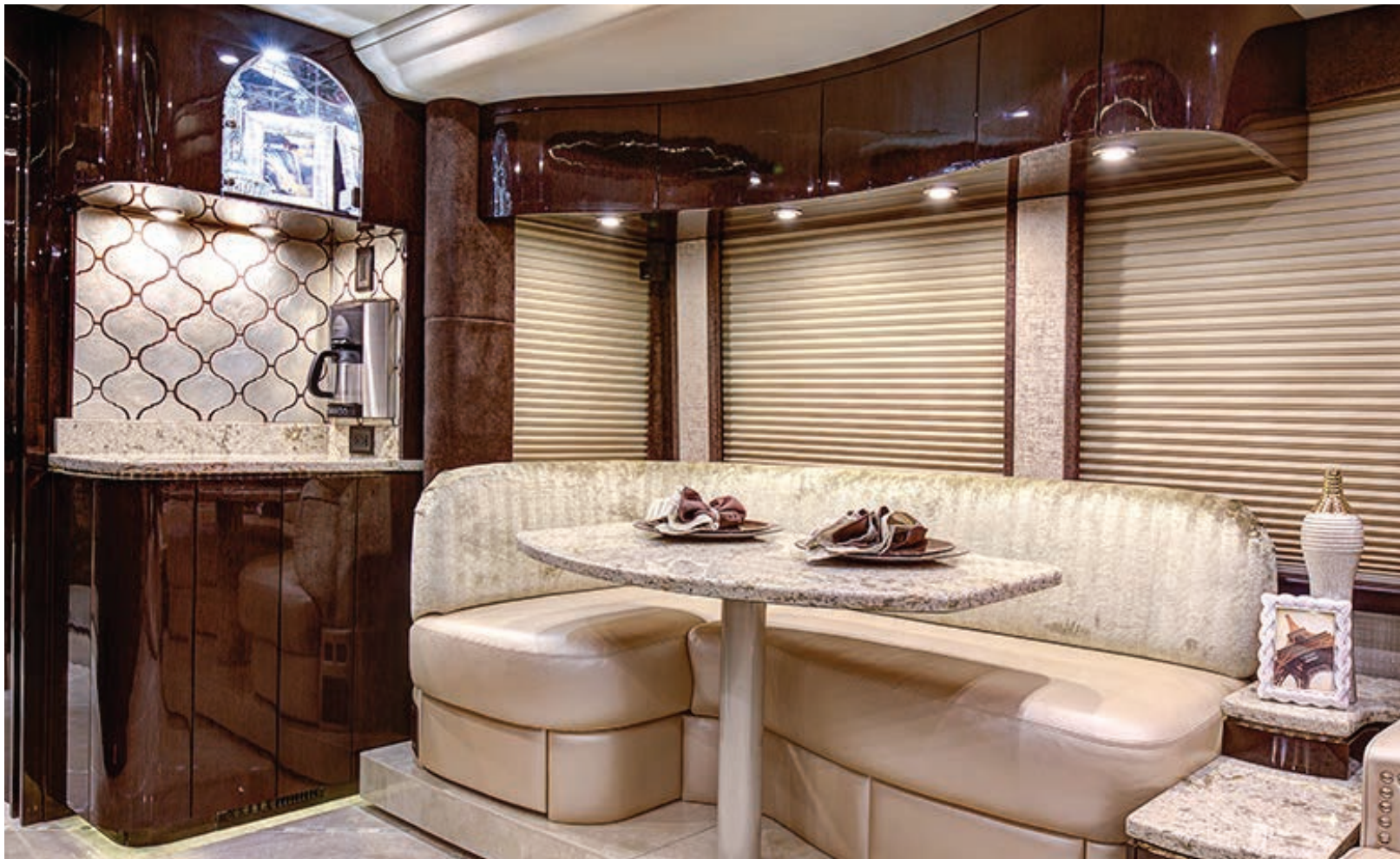
Expandable dinette makes entertaining easy. ▼