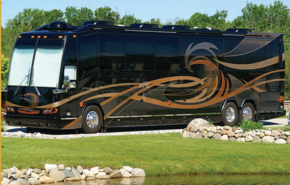
2010 Millennium H3-45 Triple Slide #0581