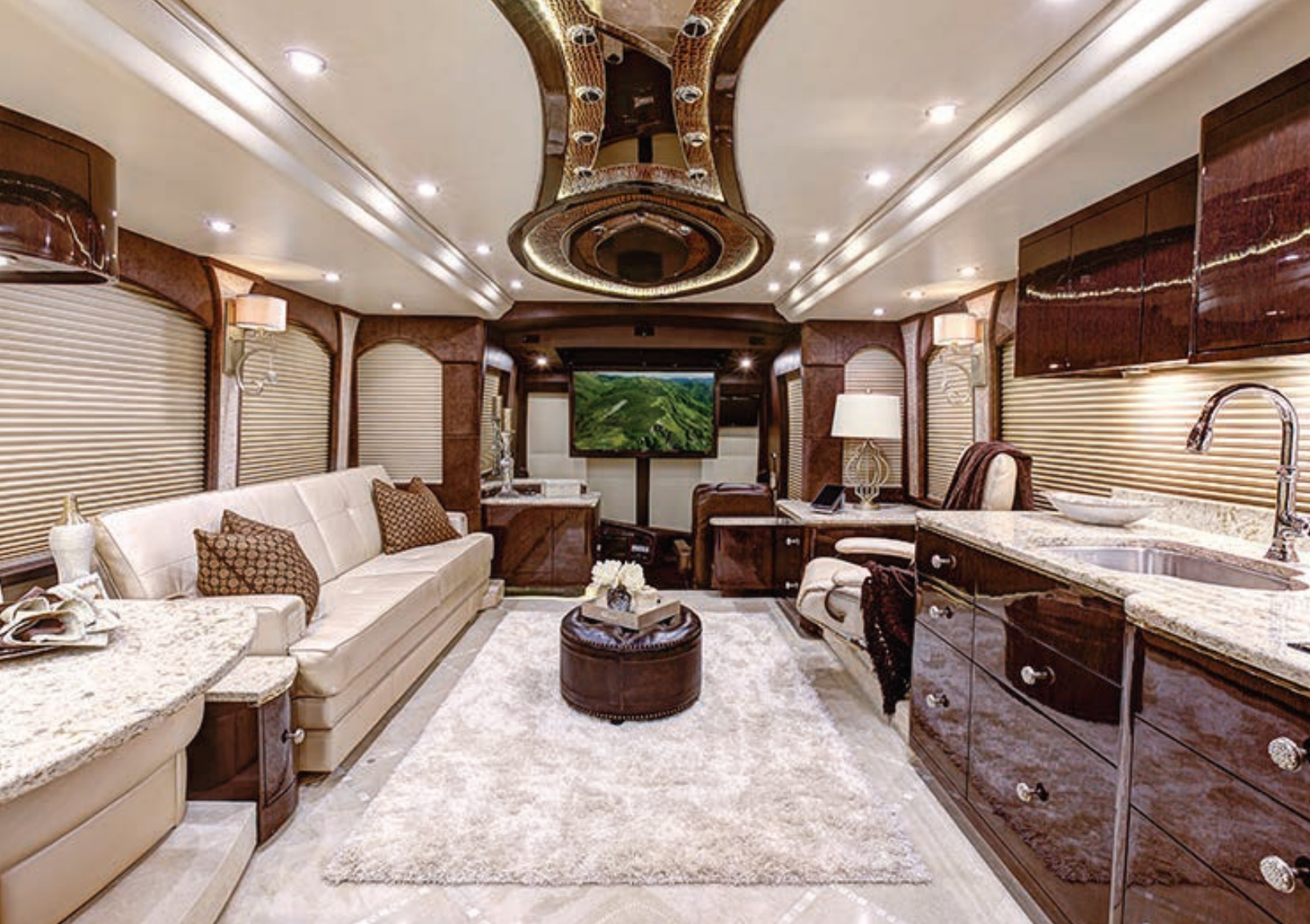
▲ Glamorous fabrics paired with custom fixtures against a backdrop of Rift Oak cabinetry.