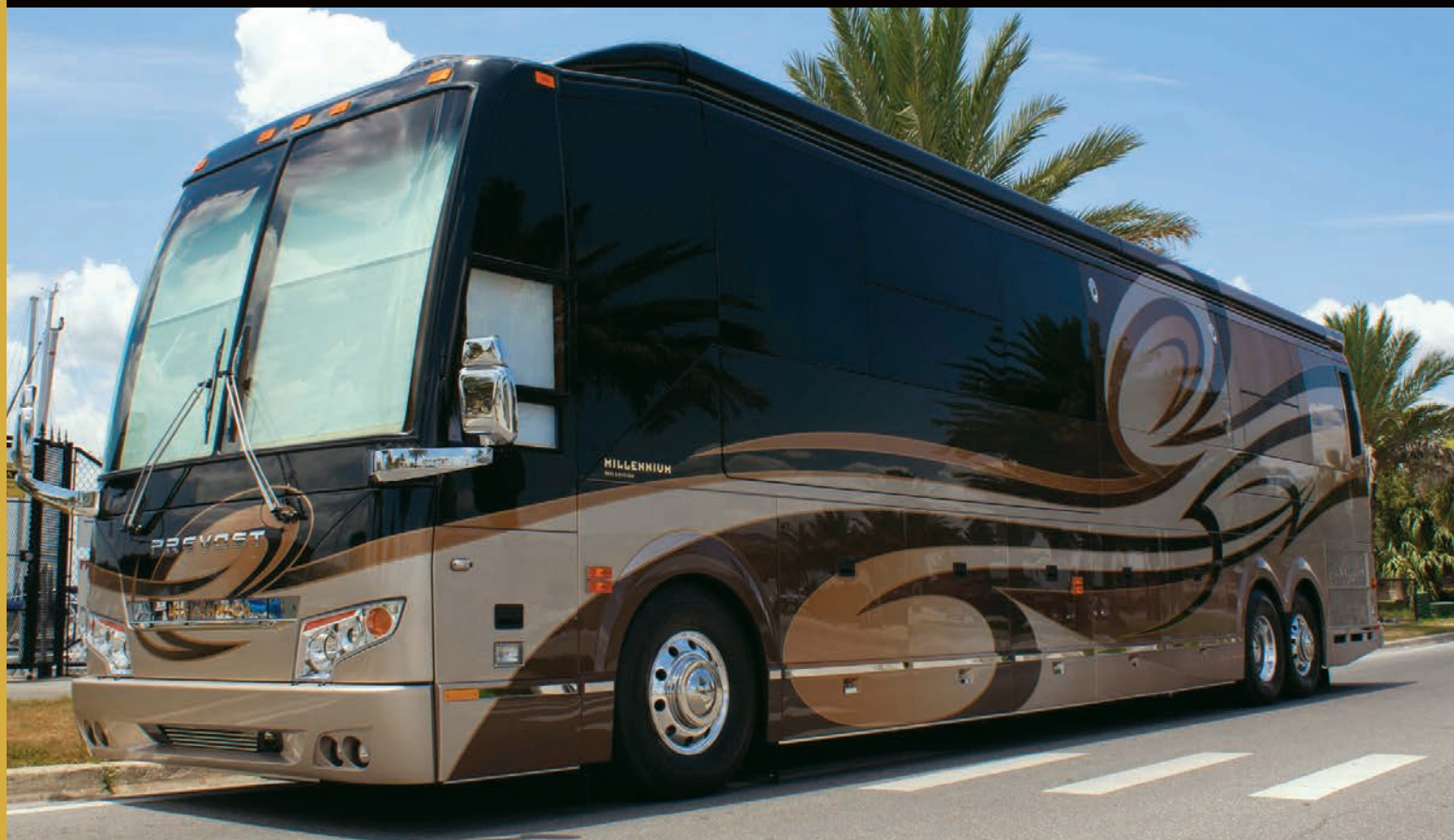
2013 Millennium H3-45 Quad Slide #0583