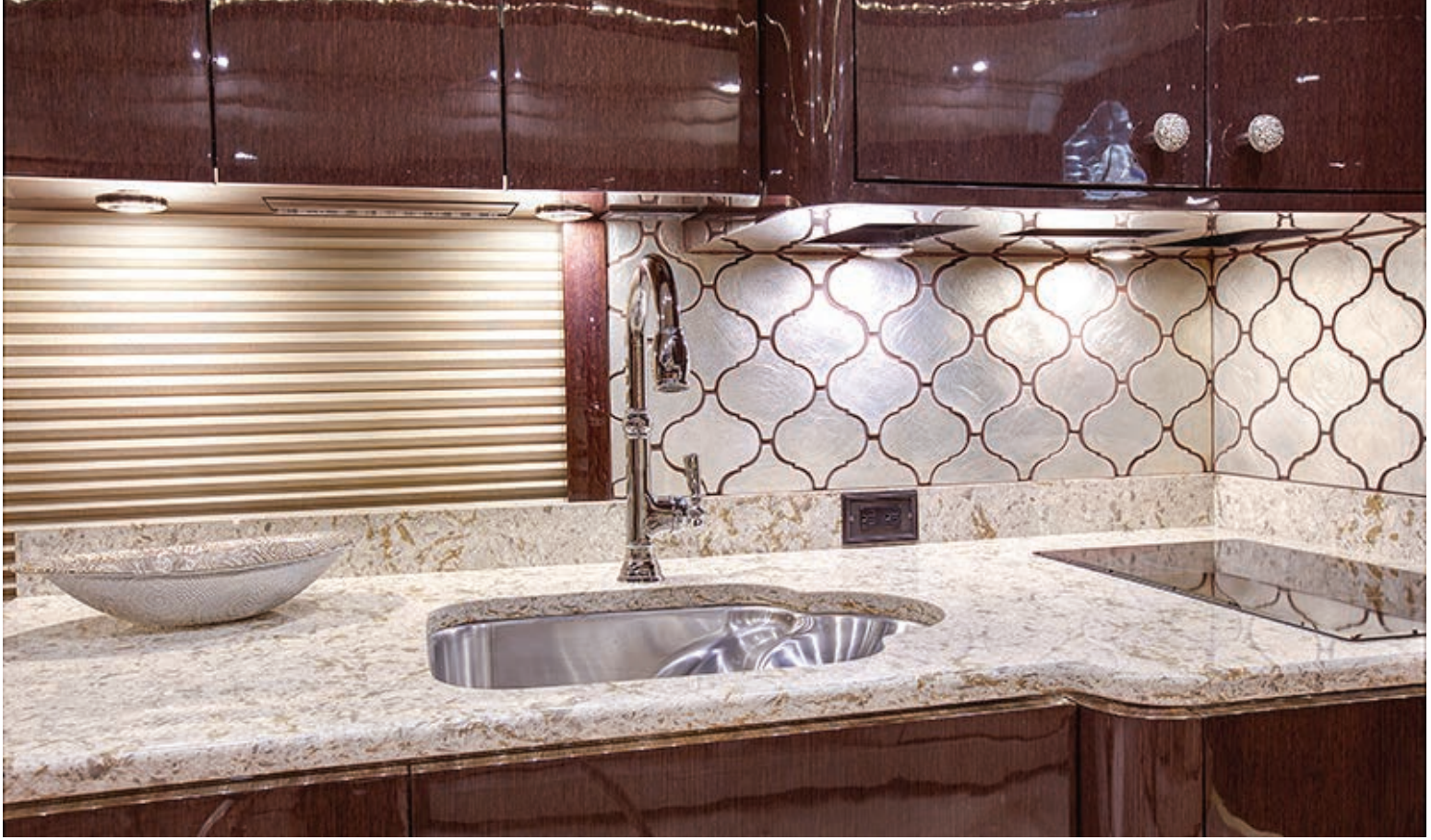
▲ This stunning galley makes meal prep a snap. The multi-purpose sink does dual duty with a built in colander and cutting board.