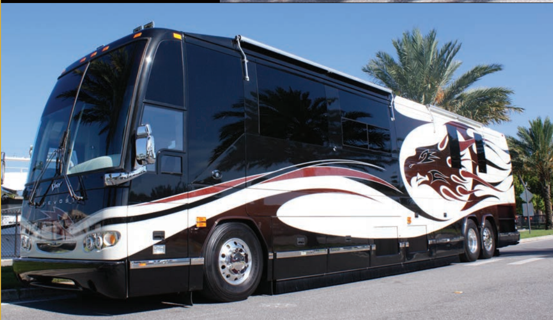
2005 Featherlite H3-45 Double Slide #0576