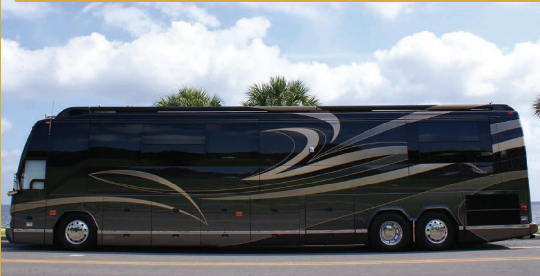
2006 Parliament Coach Double Slide #0567