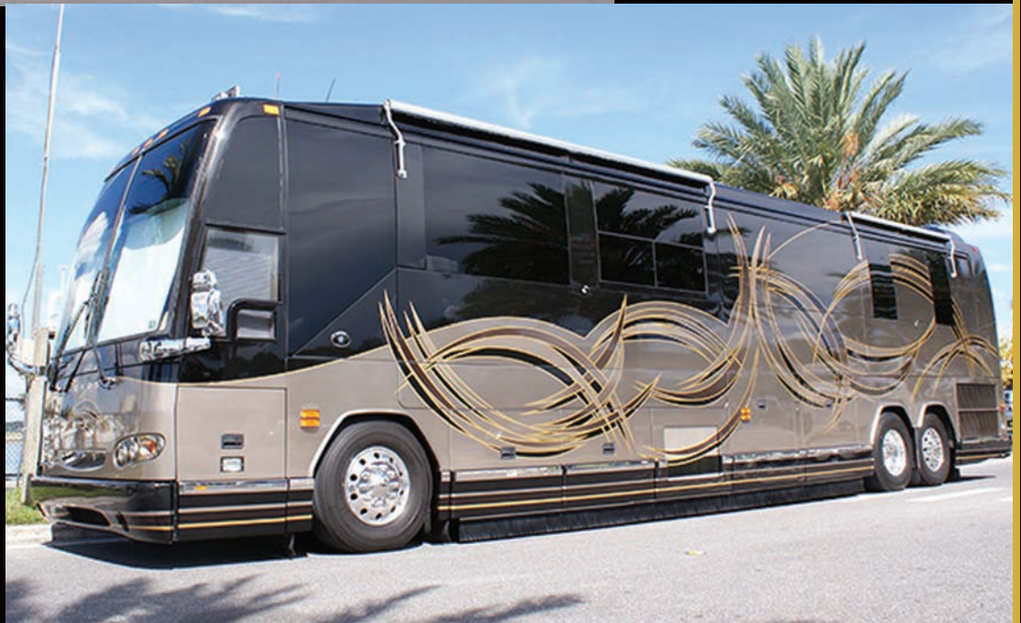
2005 Featherlite H3-45 Triple Slide #0579