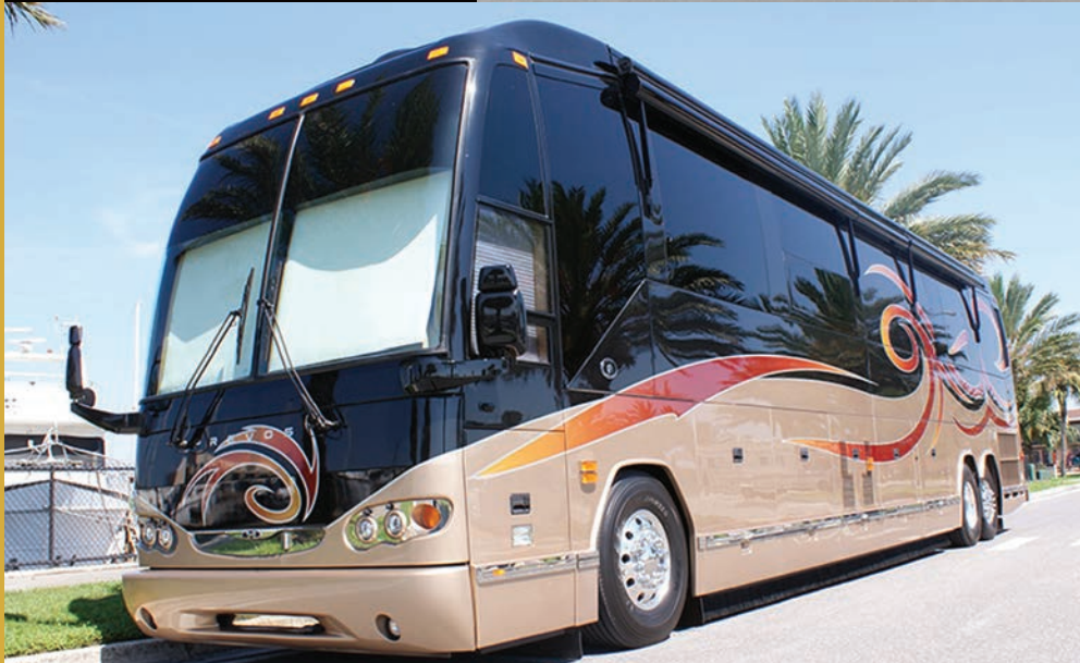
2010 Featherlite H3-45 Double Slide #0578